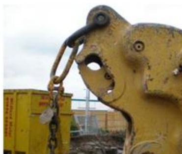
(Hitch tilted backwards with master link subject to bending)