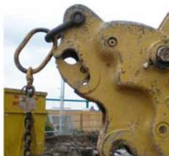
(Hitch tilted backwards with master link subject to twisting)