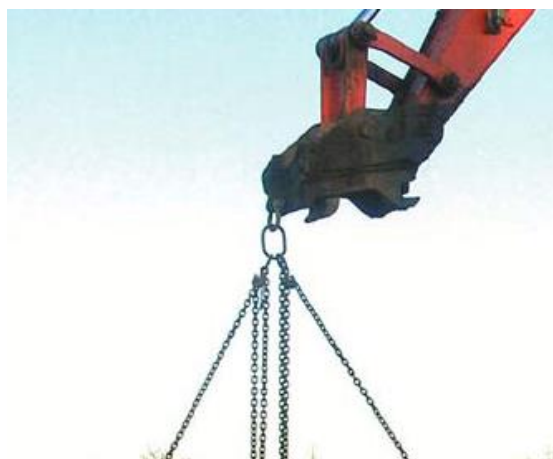
(Rigging and master link can hang freely without obstruction)